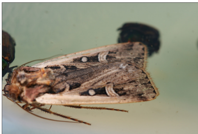
Figure 1. Western bean cutworm adult.