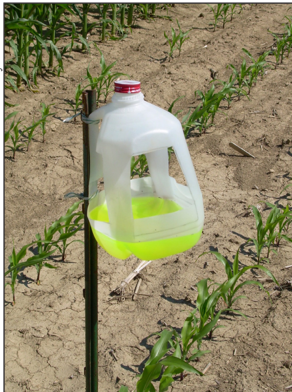
Figure 5. Corn fields can be monitored through pheromone traps. The trap above is made from an empty gallon milk jug.