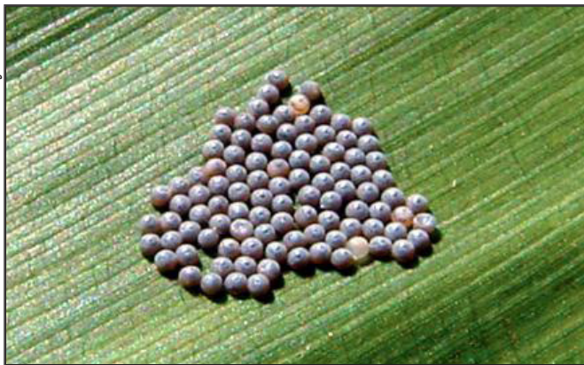
Figure 2. Western bean cutworm eggs.