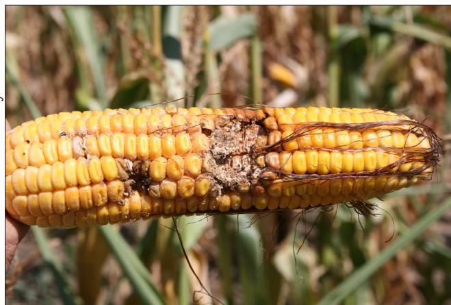
Figure 4. Western bean cutworm larvae damage.

eggs or larvae, consider treatment. For sweet corn, consider treatment if eggs or larvae are found on >4% of plants for the processing market or on >1% of plants for fresh-market.